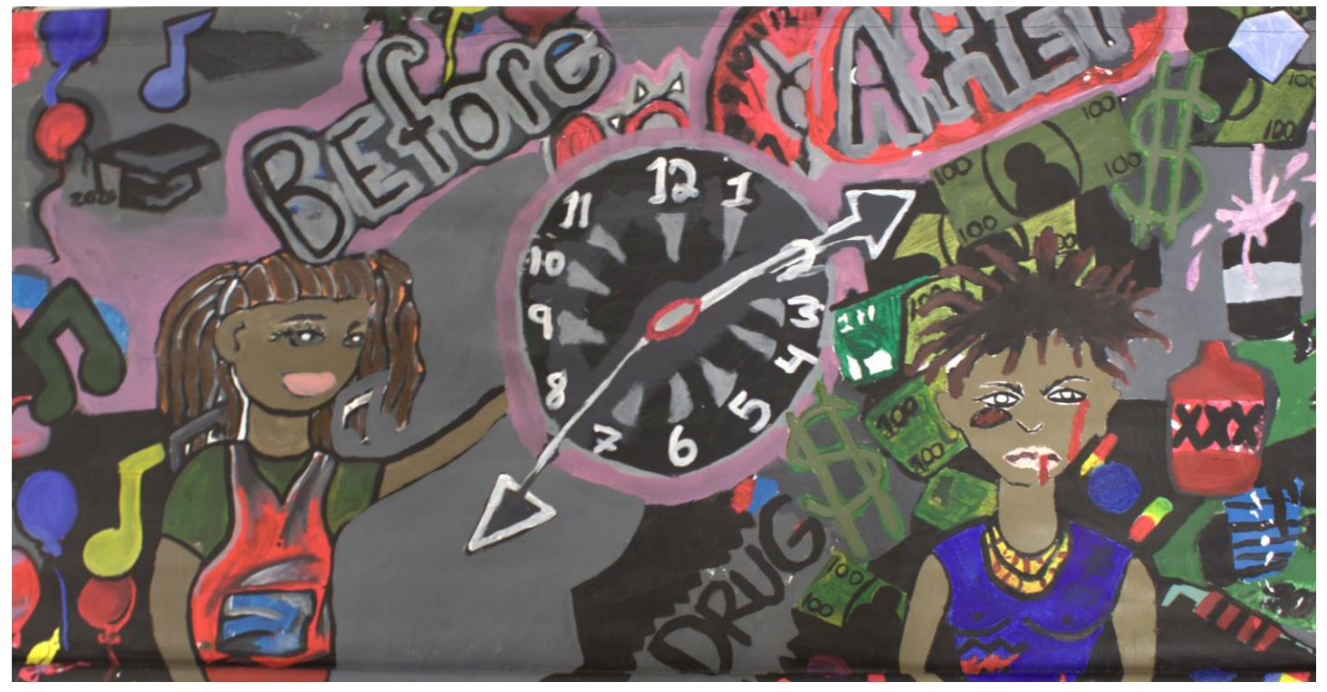
Before and After, Created by Neu-Life Youth, Fall 2014/Spring 2015