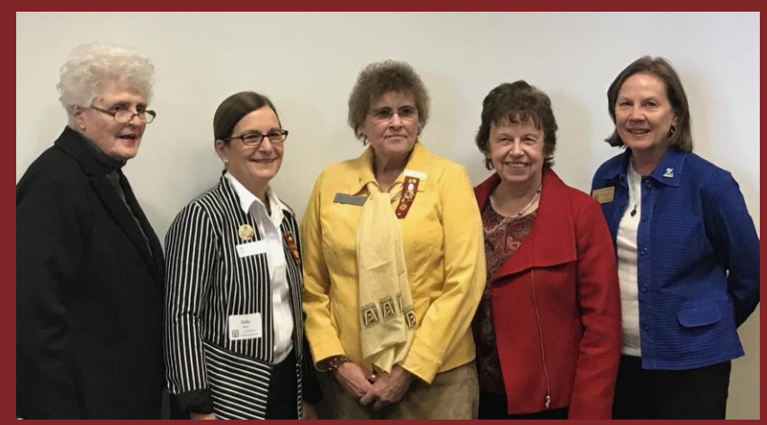
Past and Present District 6 Governors at the Area 2 Spring Workshop.

The June board meeting marks the transition to the newly elected directors and officers.