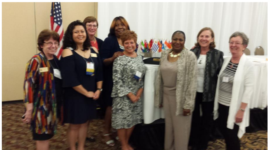
Zonta Club of Milwaukee members at the District 6 Conference earlier this month.