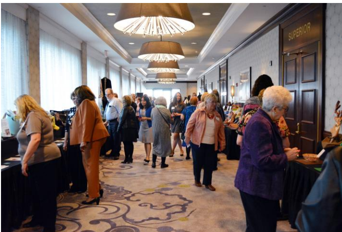
2019 Fashion Show Silent Auction