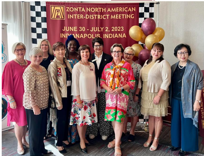
Zonta International Board