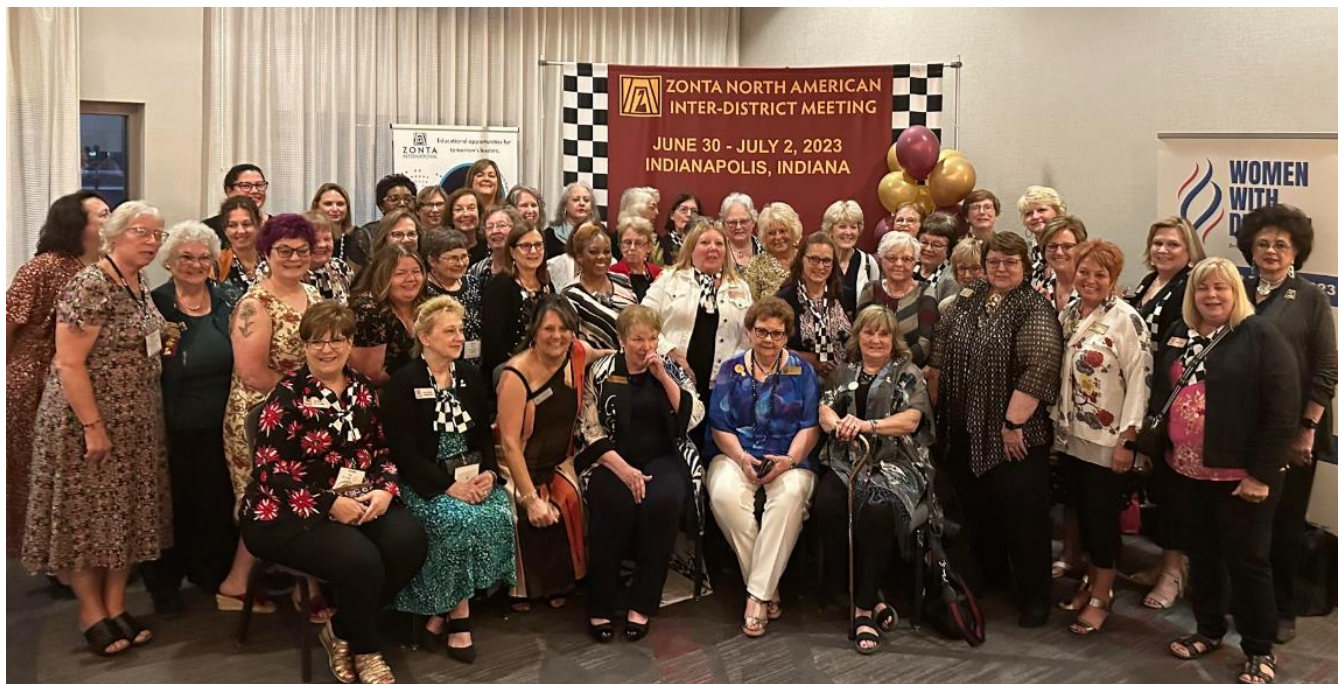
District 6 Representatives