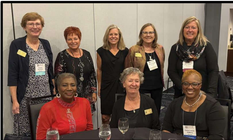
Photo: Milwaukee Club members at the District 6 Fall Conference Saturday night dinner