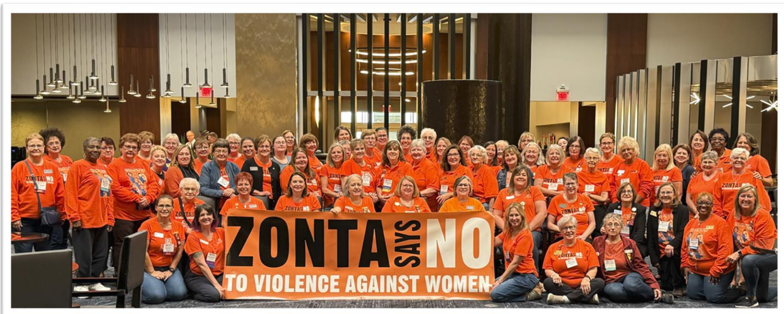
Photo: District 6 representatives in their orange at the 2024 Fall Conference. If you missed it, you missed a good one Focusing on the Future!